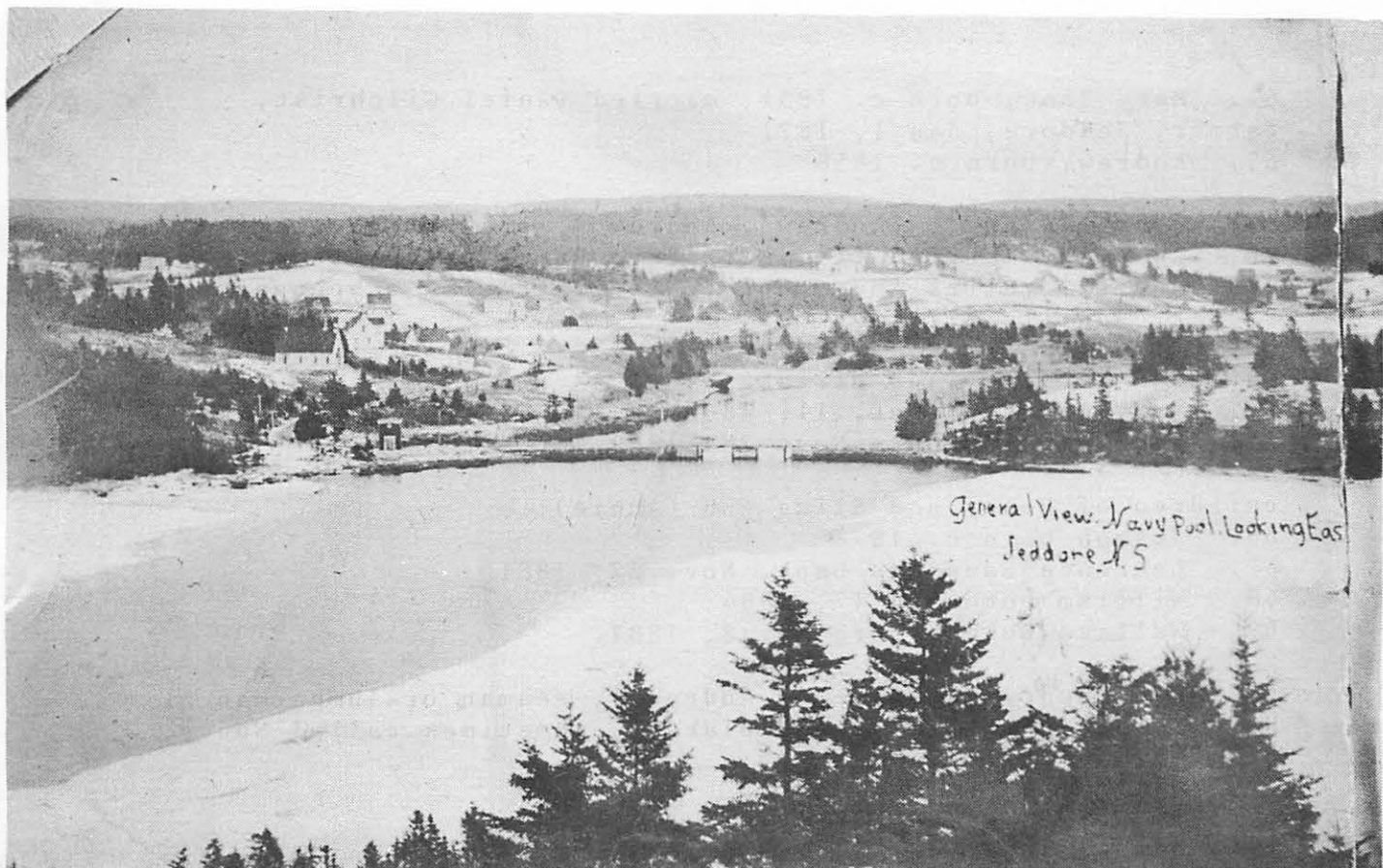
"General View Navy Pool Looking East/South East" c.1910 (NSM N-7563 & 4/P258.1a,b)