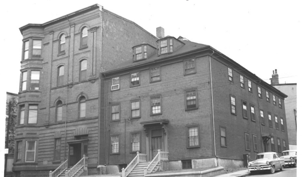
Figure 1. The corner of Barrington Street and Blowers St. On the right is Judge Blowers' house, the original Halifax Infirmary. The 1903 brick expansion is on the left. Undated.

From the spring of 1887 onwards, the Home for Aged Women increasingly provided care for patients with a variety of medical and surgical conditions. The building was renamed the Victoria Infirmary, in commemoration of Queen Victoria's Jubilee; however, it was rechristened the Halifax Infirmary to avoid confusion when the Provincial Hospital in Halifax was similarly renamed the Victoria General Hospital. Among the inaugural 6-member medical staff of the hospital were two surgeons and an eye and ear specialist. Patients were charged a rate of $5 - 8 per week of admission, while the elderly women of the Home continued to live there for $100 per year. 2,3 Though at times burdened by financial challenges, the little hospital gained a reputation for its service, hospitality, and professionalism. The hospital admitted a total of 64 patients in the year 1890 alone. 4 With increasing demand for its services, it quickly became apparent that larger facilities would be required. In 1903, a brick extension to the hospital opened its doors, and in that year 198 patients were treated (Figure 1). 1,5