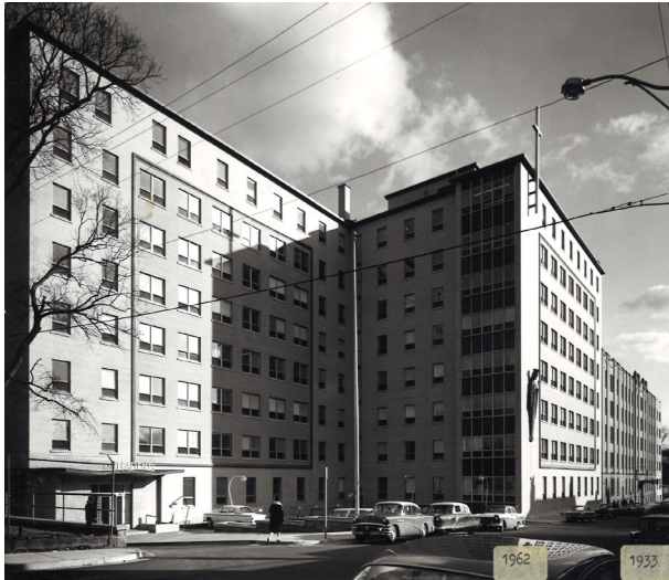
Figure 3. The Queen Street Halifax Infirmary. The prominent Jesus statue on the exterior wall may now be found at St. Vincent de Paul Parish in Cole Harbour. Taken sometime after 1961.

wing in 1962 to make way for the addition of Psychiatry, Otolaryngology, Pediatrics, Radiotherapy, Physical Medicine, and Social Services to the existing milieu of Anaesthesia, Diagnostic Radiology, Plastic and Reconstructive Surgery, Neurosurgery, Thoracics, Cardiovascular Surgery, and General Surgery. 6,13 A meticulously planned 12-bed Intensive Care Unit provided monitored care for high dependency and critically ill patients. 14 In 1963, the Halifax Infirmary saw an impressive 14 390 admissions, 3 394 births, and 7 230 operations (4 892 under general anesthetic); overall, this represented a ten-fold increase in volume over 30 years. 13 Figures 3 and 4 demonstrate the hospital during this period.