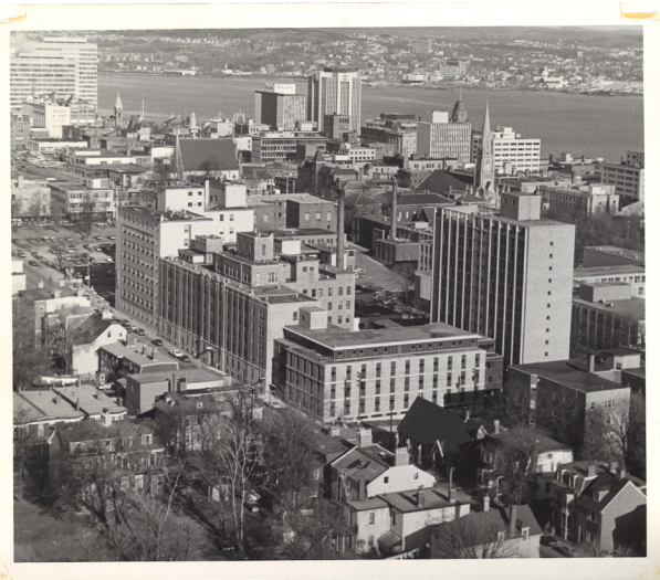
Figure 4. Aerial photograph of the Queen Street Halifax Infirmary. Gerard Hall still remains, as a Dalhousie University student residence. Mid-1970s.

Unfortunately, the 1970s were a troubled time