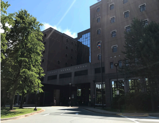
Figure 6. Summer Street entrance to the new Halifax Infirmary. 2017.

the drastic announcement of Code Orange, usually reserved for mass casualty events. 80 Intended to alleviate the strain on Emergency Department resources, this action compelled in-patient units to hasten admission of Emergency Department patients. This practice would later be redeveloped into a new Code Census alert. Though the June 2009 opening of an extensive Emergency Department expansion was hoped to provide some relief for this overcrowding, the capacity of the Halifax Infirmary is still continually being tested, with 23 Code Census alerts in January 2017 alone. 80-82