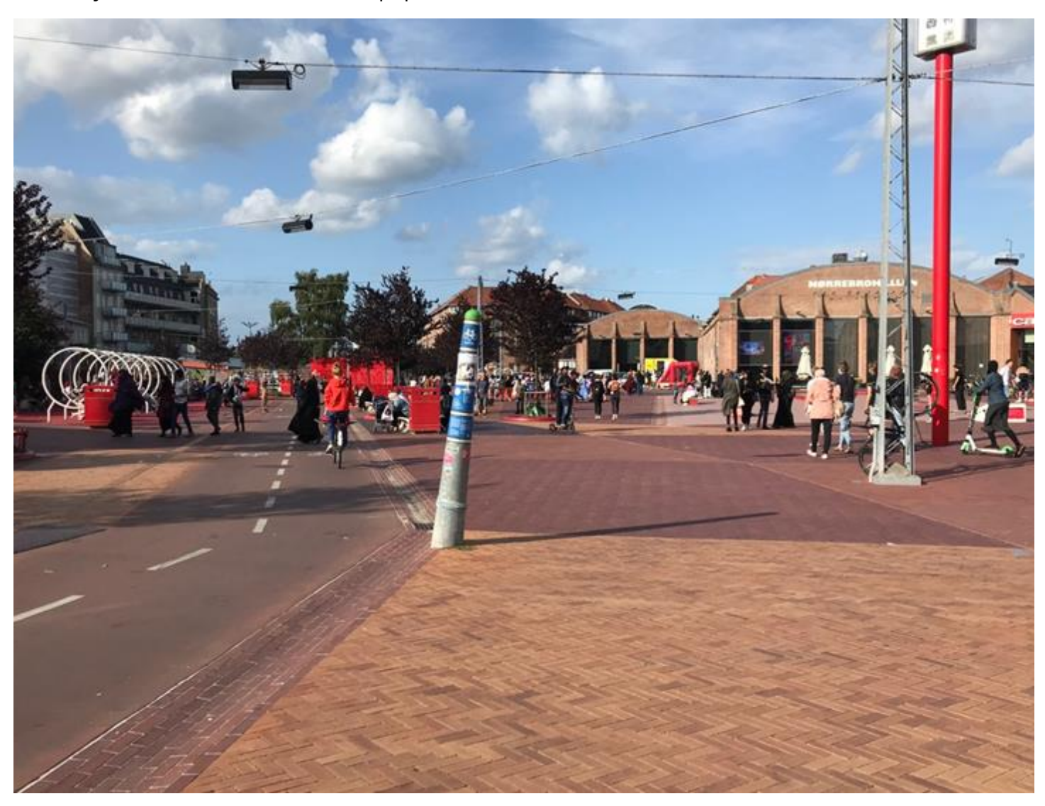
Figure 2: The Copenhagen Cycle Highway crosses through a lively square in the city.

Mobility is more than just physical movement (Salazar 2017, 5). Lelièvre and Marshall (2015) differentiate between the two by deeming movement to be an object of observation while mobility is an object of study. According to