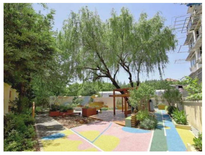
Figure 4. Hongxu Habitat Garden in Hongxu Community, Shanghai.

design and lead garden construction. The construction started in June 2019 and was completed through three stages of workshops that residents participated in. The garden has planting boxes consisting of 90% perennial flowers and herbs and 10% vegetables. It also has a play area for children, compost bins, a rainwater collection system, and a pond. A Residents' Committee staff member organizes resident volunteers to clean up the garden, compost, and water from time to time.