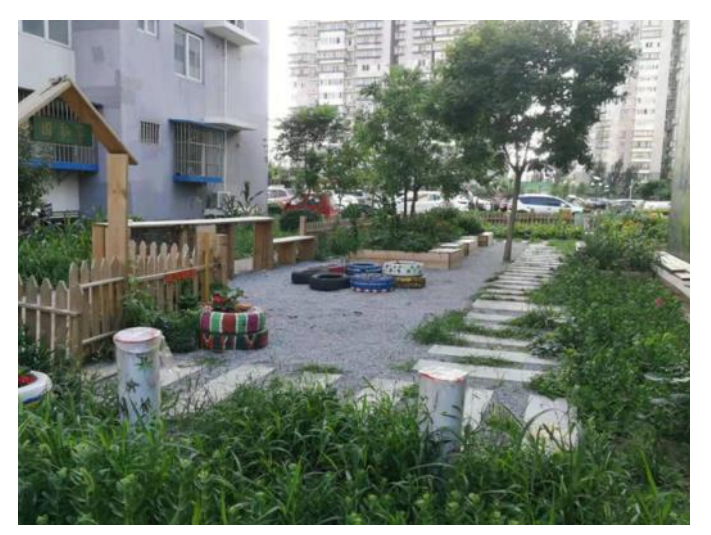
Figure 2: Cuifu Garden.

who came to the gardens and how they interacted with the gardens. I asked the residents' consent to participate in interviews at the gardens and if they would also direct me to other key informants. The semi-structured interviews covered their engagement with the garden, personal history of gardening if applicable, and how they assessed the garden in terms of benefits and challenges, both the physical and social/political aspects. In addition, I interviewed non-resident actors involved in the gardens' development, including staff from Residents' Committees, NGOs, and social enterprises. The interviews were all conducted in Chinese and not recorded.