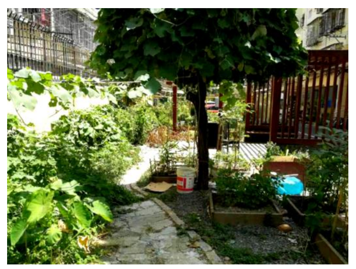
Figure 5. Xin Garden in Zhengli Road 580 Lane community, Shanghai.

Happiness Garden, built in June 2019 over two weekends of participatory workshops, is located residential in liagichang community in northwest Beijing (Figure 3). Residents gave the garden a Chinese name " xingfu ," which translates to happiness. Jiagichang community used to be home only to the staff working in the Gas Filling Plant (a state-owned enterprise), and it did not open up to outside buyers/renters until recently. The garden sits on a 270-squaremeter public green space between two residential high-rise buildings. Its design is based on permaculture principles, featuring