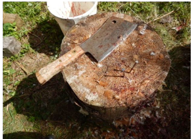
Above: Beheading Below: Compost