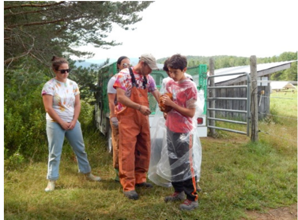
Above: Covering chickens eyes