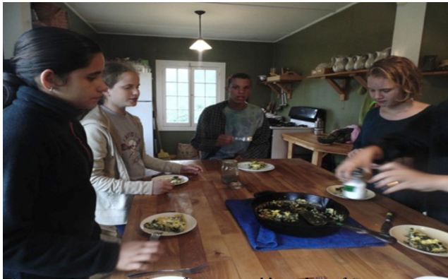
Figure 3 Campers enjoy a farm vegetable and egg frittata breakfast in the camper kitchen. 2014.

Brigitte, my sister, is now in her thirties, her years as a camper long behind her; but she is happy to recount this sensory experience, one that allowed her to know herself afresh. The cold water didn't feel pleasant, but knowing that she was harvesting vegetables for a meal for her friends and counselors produced pride, and she considered the movements meditative.