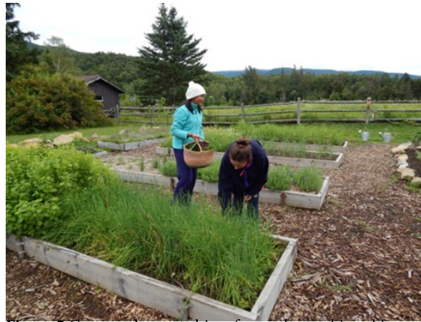
Figure 5 Campers harvest chives for garden sushi-making activity. 2014.