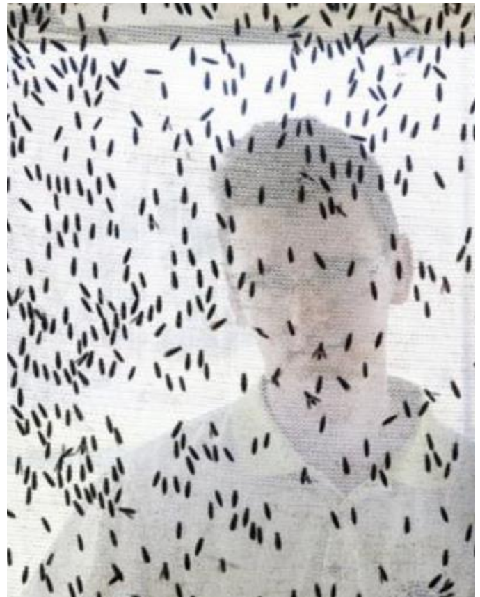
Figure 1: Investigating the breeding colony at the world's first insect nutrient recycling plant.