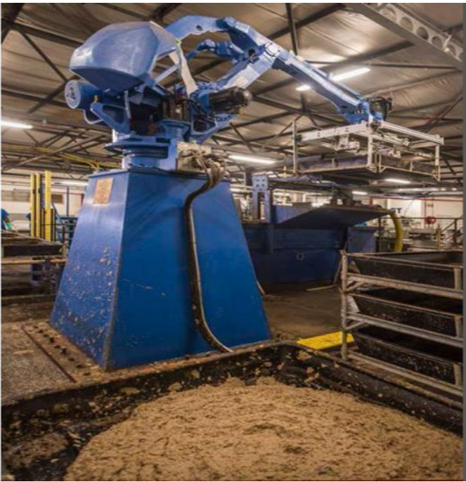
Figure 5. Robotic co-ordination at the twenty-four-hour canteen. Larvae lunch is pumped from two silos in the waste processing plant to meet the larvae recyclers who initiate the bio-conversion process.

material violence used barbed wire to police boundaries around private land (Blomley, 2003). This section will question what it means to police artificially constructed boundaries around nature and analyse the inherently violent act of dispossession and enclosure that seeks to circumscribe the natural world. The act of patenting “confers a temporary monopoly on the holder” subject to that invention being made available in the public domain (Jasanoff 2012, 165). Intellectual property laws, however, were not written with biotechnology in mind; “the assumption under Western legal systems is that nature is the common property of human kind” (Jasanoff, 157).