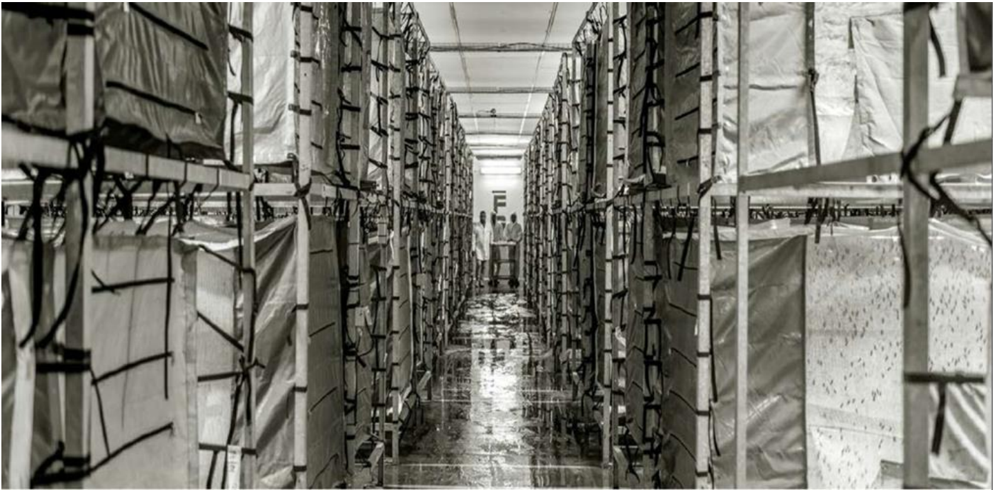
Figure 4: Navigating the tight aisles between cages to service them with 'larvae cologne'.

When the factory managers and scientists try to enhance natural efficiencies, they turn towards an industrial model of production. Whilst the mathematical spaces of the insect cages mimic nature, they are also producing an anticipatory infrastructure for enclosure. At the moment in which nonhuman life is acknowledged as a source of inspiration, "it is simultaneously circumscribed" as capitalism seeks to confine nature to a finite space of industrial production (Braun 2008, 668). Encircling nature in this way is not random, it depends upon a team of entomologists and industrial engineers who mathematically generate spaces that are conducive to mass insect production. This forges a relationship between economic forces and nonhuman nature that is no longer dialectic, but rather one where capitalist forces act in opposition to a recalcitrant form of nonhuman life (Harvey and Braun 1996). The scientific reasoning that is used to redesign and amplify natural process in the insect factory is premised upon minimising the resistance of nonhuman life rather than simply emulating nature's processes. Insects do everything in their power to resist enclosure, and constantly seek ways of escaping the spaces in which they are confined. This represents a move beyond biomimicry, towards a mimicry that acts in constant service to capital production rather than nature itself.