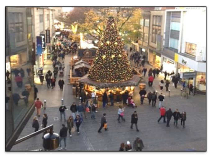
Figure 5: View of Broadmead and Christmas Market from Cabot Circus

performers playing their musical instruments, arts and craft stalls selling their wares, or apparently homeless people who line the walkways right up to the entrances of Cabot Therefore, unlike the artificially Circus. constructed demographic of Cabot Circus, Broadmead could be said to represent the messy and plural realities of Bristol's inner-city life, encompassing many differing individuals and unregulated behaviours, and thus largely operating as 'a space in which activity detrimental to consumption and with disruptive potential' can still erupt (Phillips 2010, 268).