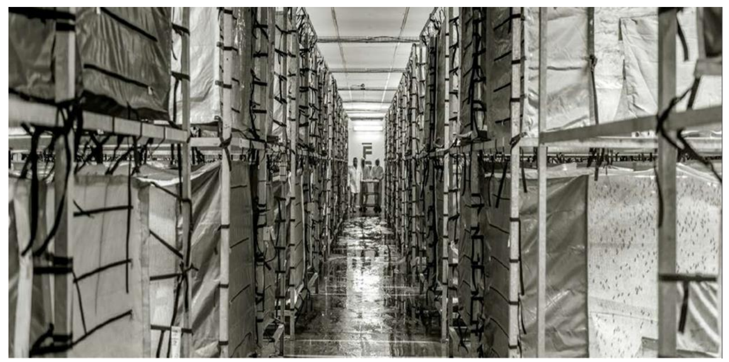
Figure 4: Navigating the tight aisles between cages to service them with 'larvae cologne'.

When the factory managers and scientists try to enhance natural efficiencies, they turn towards an industrial model of production. Whilst the mathematical spaces of the insect cages mimic nature, they are also producing an anticipatory infrastructure for enclosure. At the moment in which nonhuman acknowledged as a source of inspiration, "it is simultaneously circumscribed" as capitalism seeks to confine nature to a finite space of industrial production (Braun 2008, 668). Encircling nature in this way is not random, it depends upon a team of entomologists and engineers who mathematically industrial generate spaces that are conducive to mass insect production. This forges a relationship between economic forces and nonhuman nature that is no longer dialectic, but rather one where capitalist forces act in opposition to a recalcitrant form of nonhuman life (Harvey and Braun 1996). The scientific reasoning that is used to redesign and amplify natural process in the insect factory is premised upon minimising the resistance of nonhuman life rather than simply emulating nature's processes. Insects do everything in their power to resist enclosure, and constantly seek ways of escaping the spaces in which they are confined. This represents a move beyond biomimicry, towards a mimicry that acts in constant service to capital production rather than itself. nature