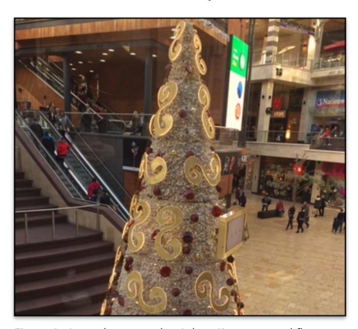
Figure 3: Central area on the Cabot Circus ground floor. Foreground: Christmas tree. Background: Advertisement board

screen attached to its front, whilst also using visual and audio displays to promote seductive tempting products, ranging confectionary to sports cars (Bauman 2000). Overshadowing this is а large advertisement screen affixed to the side of the shopping centre lifts that rotates through a silent catalogue of various brands located within Cabot Circus, successfully captivating and arguably regulating the eyes of the consumer by manufacturing a highly individualised (Bauman 2000, 97) environment, where people learn to 'not look at each other but make themselves busy' (du Gay 2004 in Cochoy 2007, 115). One advert even cleverly plays on this logic, using 'we saw you looking' as a satirical strapline to perplex viewers, whilst perhaps also subconsciously reminding them to remain immediate the commercial distractions available directly in front of them.