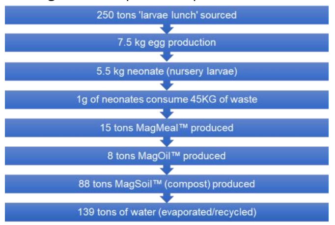
Figure 2: The phases of the insect nutrient recycling process.

The building blocks of biomimicry lie in a discipline that seeks to repair a nature-society divide, in order to reverse humankind's "unreceptive relationship" with the natural world (Benyus 1997, 287). A number of scholars argue that humanity has forgotten its connection with nature and, as a result, nature is cast as an "abandoned realm" set off from the 'human' (Braun 2008, 667; Smith 1984). The environment has become an abstract sphere, rendered as a mere "receptacle" of natural resources to be exploited for human advance (Braun 2008, 668). The underlying promise of biomimicry is to re-establish our intimacy with natural world, emulating nature's redesign knowledge ingenuity and to sustainable production systems. Building on nature's "four-billion-year head start." reimagines ecologically sustainable modes of production that do not seek to "tame or override" nature (Khan 2017, 7). It attempts to reimagine anthropocentric production methods