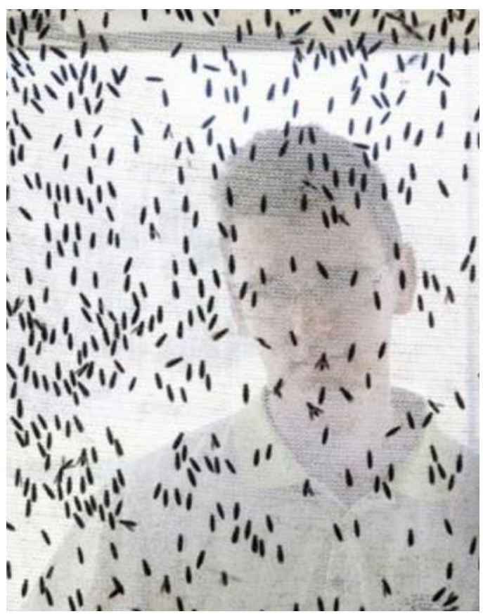
Figure 1: Investigating the breeding colony at the world's first insect nutrient recycling plant.