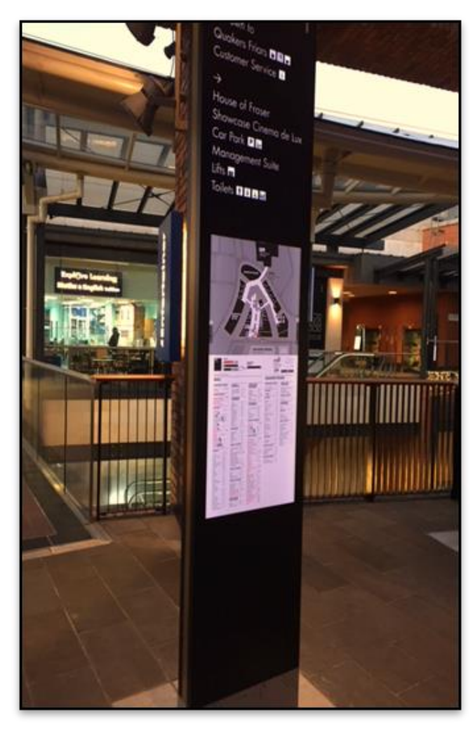
Figure 4: New store directory on the top floor of Cabot Circus

that visitors should come to expect a certain appearance when visiting the shopping centre, whilst also reinforcing a very particular conception of beauty, these temporary fences would then be branded with the Cabot Circus logo and slogan, alongside an apologetic message addressed to customers: 'So sorry we're not looking our best, we will be back and beautiful as soon as we can.'