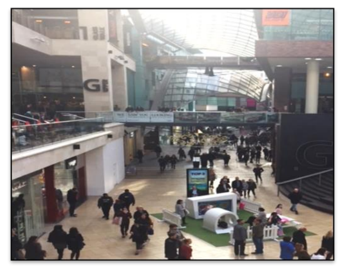
Figure 2: Cabot Circus shop floors and walkways

As argued by Allen (2006, 443), it is now possible to control and 'stage the public character of privatised spaces,' and indeed, through its architectural design, Cabot Circus is visually presented as an open space. There are no entrance doors or barriers that one must pass in order to enter, simply metal bollards marking out where no vehicles are permitted. The city air ventilates the shopping centre, whilst the uniquely suspended floating glass roof exposes the skies overhead (see figure 1), creating 'a series of interlocking and floating forms that choreograph the streets and buildings' (Phillips 2010, 278). The intermittent sounds of sirens echo throughout the shopping