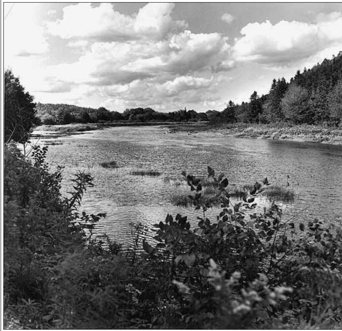
Plate HI.1: Habitat diversity in the landscape. St. Marys River, Guysborough County (sub-Unit 413b). The view includes flowing open water (H3.1), fen (H4.2), river bank (H3.5) and mixed forest (H6.3).

tivation, severe fire or other forms of clearance. The climax-forest types represent the last stages in succession, where the species maintain the conditions suitable for their own continuance. Figure HI.2 shows three seral stages in the development of a climax forest on an abandoned field. The nature of the successional process will obviously depend upon the conditions prevailing on the site, particularly climate, soil and moisture. Significant changes are seen when the site is subjected to other factors, such as fire or cutting. Table T10.4.1, in Plant Communities in Nova Scotia , shows the relationship between site conditions and dominant-tree-species compositions in terms of seral stage.