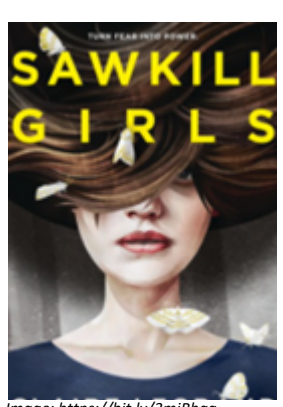
Sawkill Girls by Claire Legrand

Key message from author: Never put limits on yourself! It is a super inspirational story that encourages young people to learn in a way that makes a difference by using their voice.