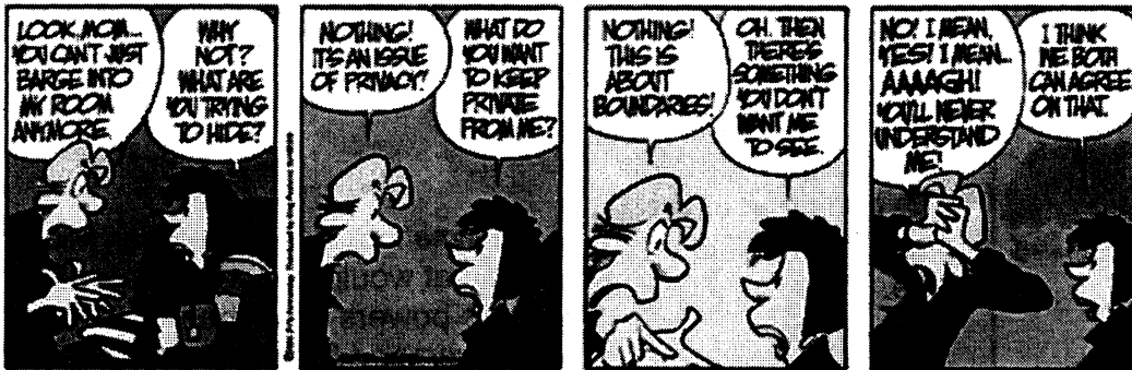
From "Zits". Copyright 2005 Jerry Scott and Jim Borgman

When you consider buying comics and graphic novels for your YA collection, think about buying titles that feature teens. Teenagers love to read about themselves, and why shouldn't they? We all seek out reading material that helps put voice to our personal thoughts and experiences. This is especially true for teens, who are in the process of developing their identities. Comics and graphic novels are like any other form of entertainment; they can guide teens through difficult times by showing other teens who have faced the same problems.