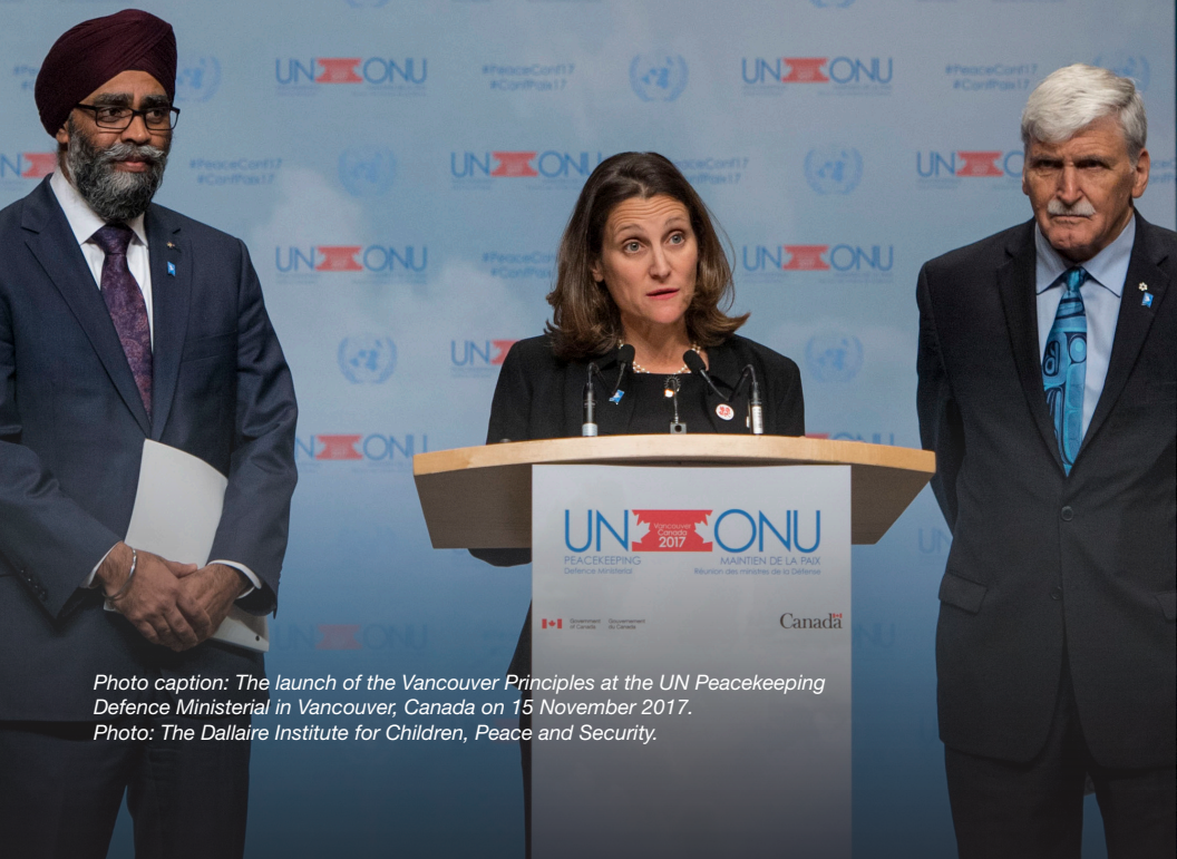
Photo caption: The launch of the Vancouver Principles at the UN Peacekeeping Defence Ministerial in Vancouver, Canada on 15 November 2017.