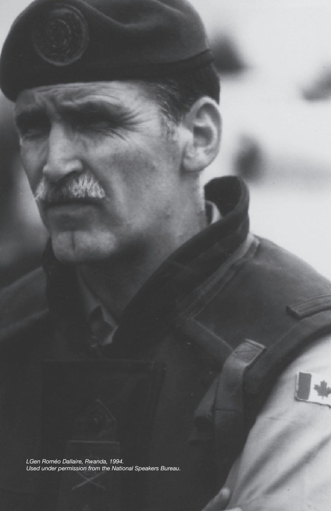
Lt. Gen. Roméo Dallaire, Rwanda, 1994. Used under permission from the National Speakers Bureau.