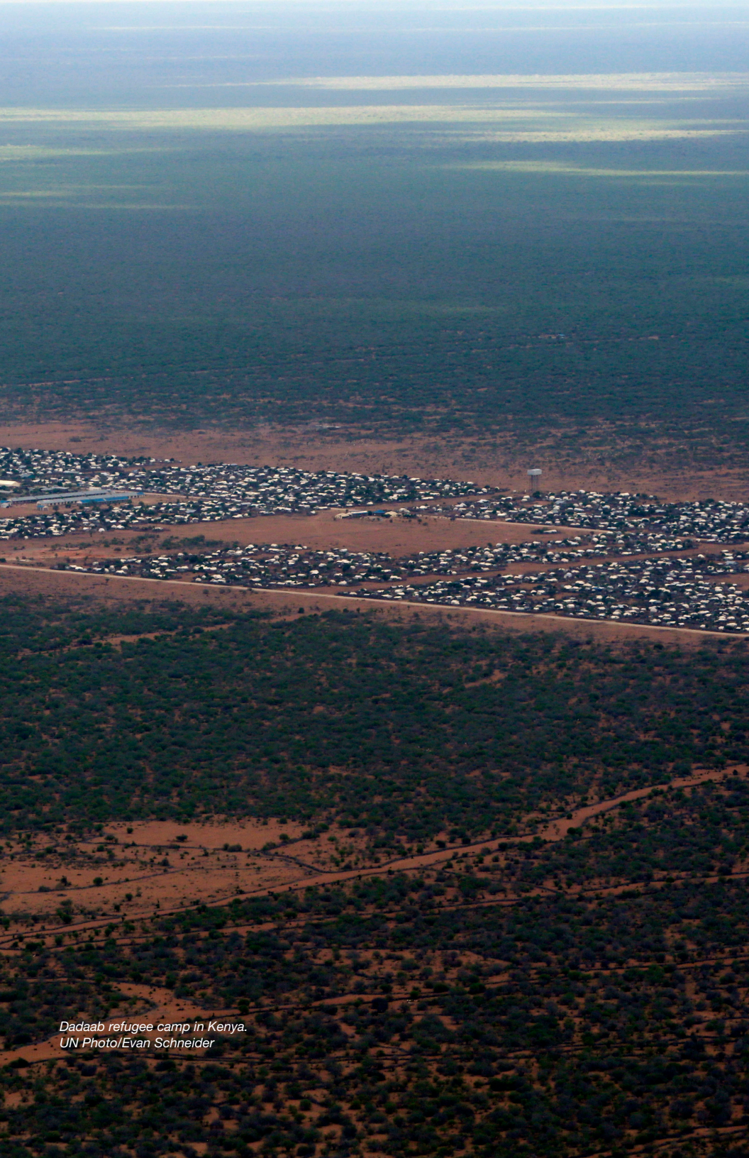
Dadaab refugee camp in Kenya.