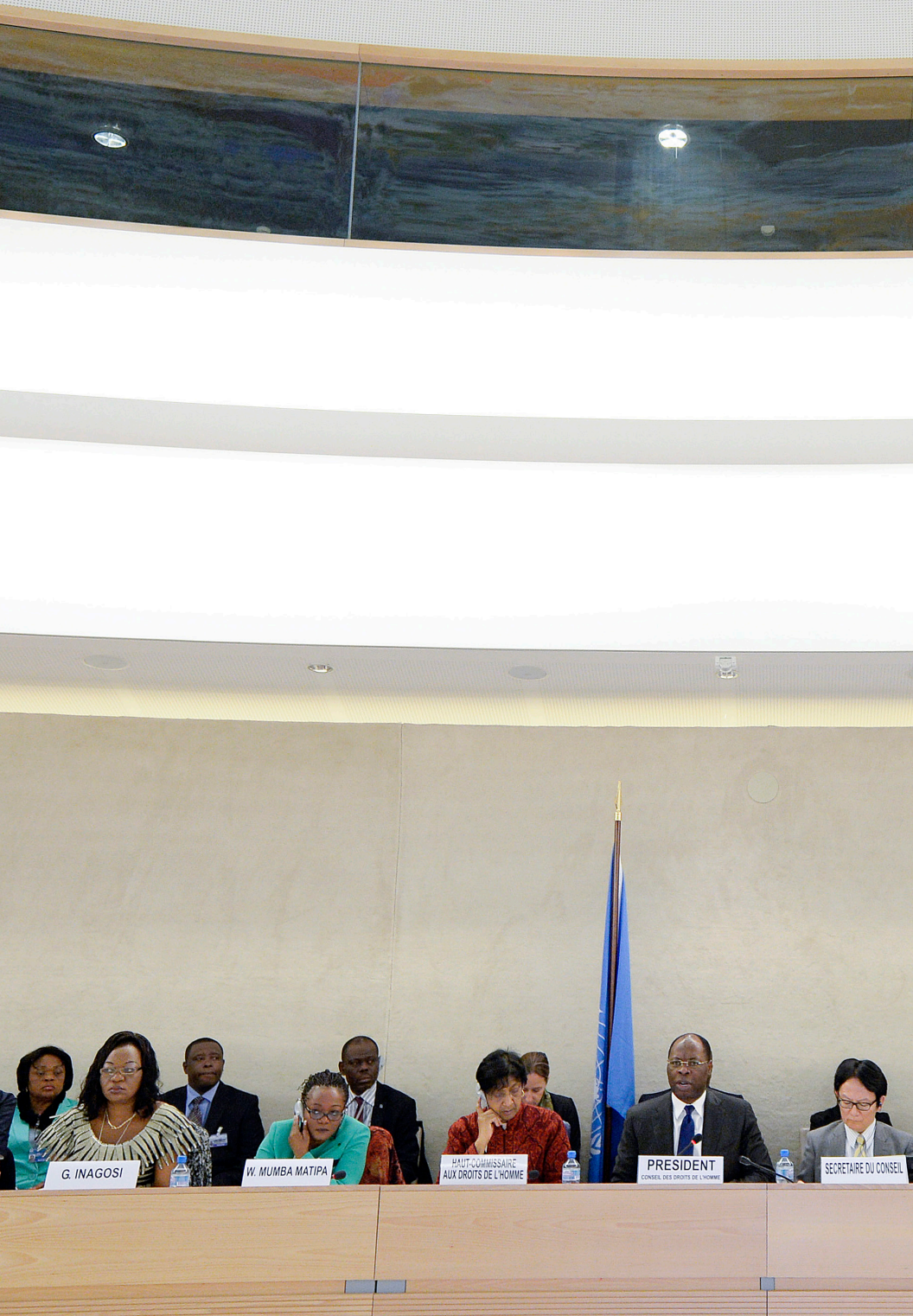
The UN Human Rights Council discusses sexual and gender-based violence in the DRC.