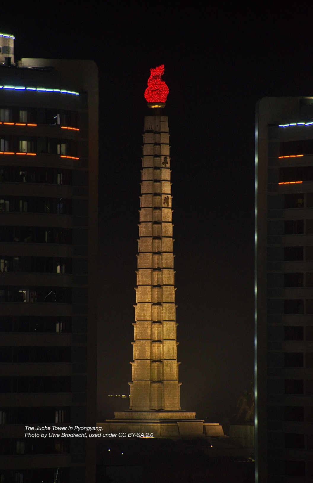
The Juche Tower in Pyongyang.