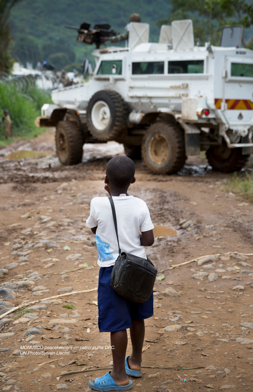
MONUSCO peacekeepers on patrol in the DRC.