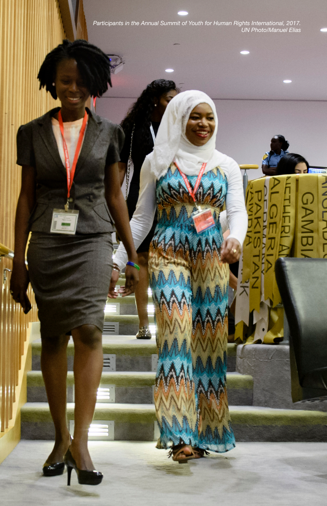
Participants in the Annual Summit of Youth for Human Rights International, 2017.