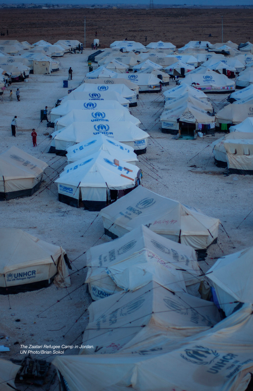
The Zaatari Refugee Camp in Jordan.