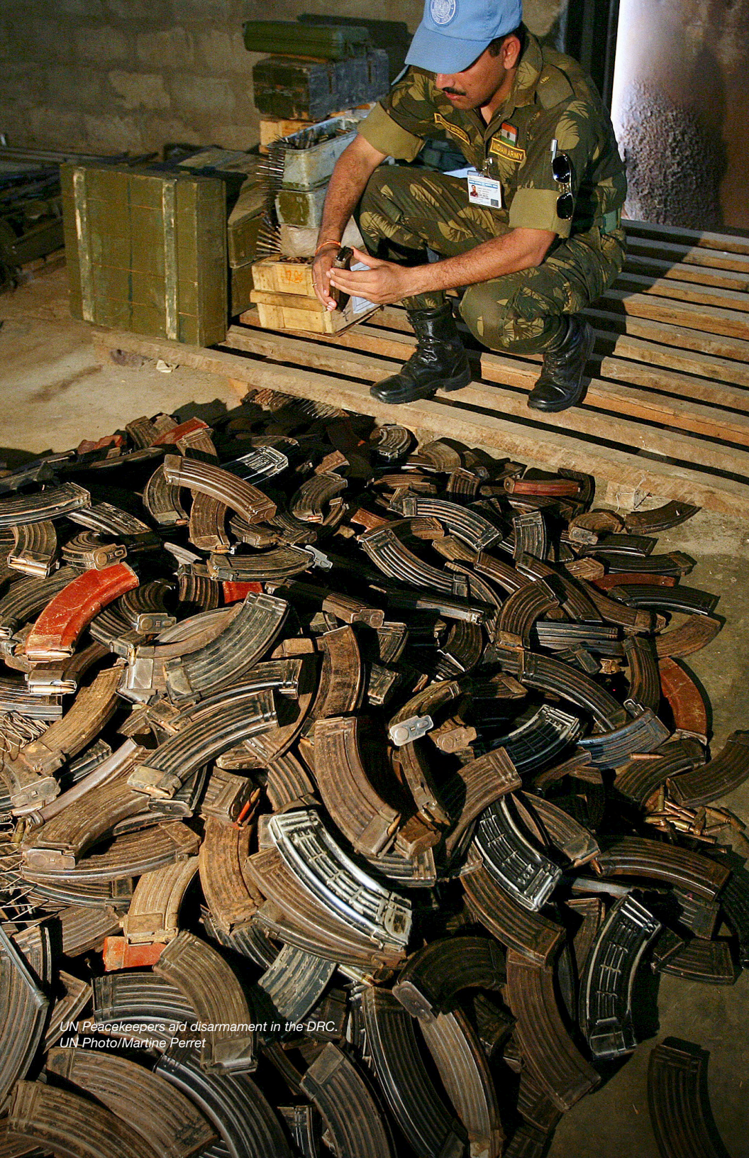
UN Peacekeepers aid disarmament in the DRC.