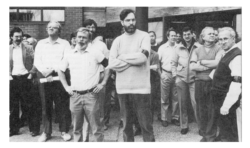
Fig 5 Protesting the closure of MEL on 1 April 1978.

open and somewhat hostile audience. He stated that, because of the pressure to downsize, it was necessary to amalgamate oceanography and fisheries in DFO but that, while some names were disappearing from the organizational structure, functions were not, they were merely being redistributed. He felt that long-term multidisciplinary research of the type carried out by MEL was not threatened. Although this meeting helped to reduce the atmosphere of confrontation, MEL staff were still most concerned about the future.