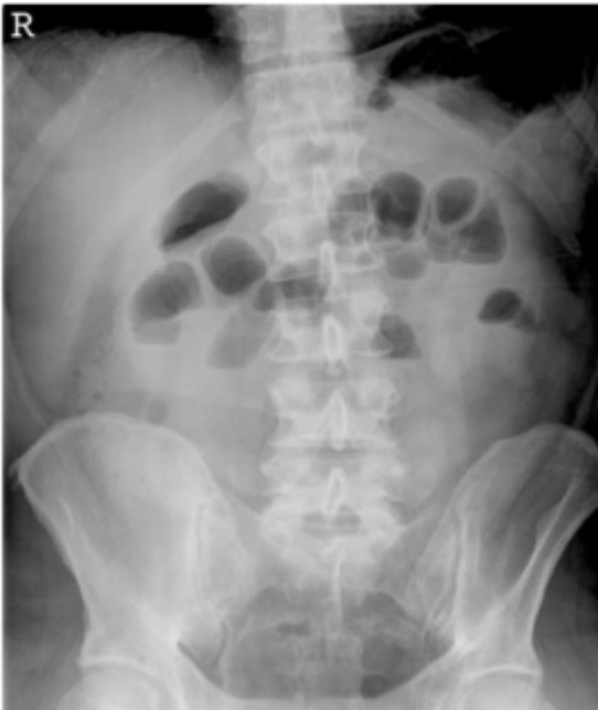
Fig 1 Abdominal x-ray (AXR) demonstrating the entire abdomen from the diaphragm to the symphysis pubis (Gans, Stoker & Boermeester, 2012).

Diagnostic imaging is a tool commonly used by hospital emergency departments that helps to determine the cause of a patient's symptoms. If a patient's history, physical examination, and laboratory testing does not identify the underlying cause of their symptoms, imaging is indicated as the next step in the diagnostic process (Cartwright & Knudson 2015). Indications for patient's presenting to the emergency department that would require abdominal imaging include suspected bowel obstruction, abdominal pain, constipation, suspected bowel perforation, and foreign bodies within the abdomen (Bertin et al. 2019). Imaging for these clinical indications is either an abdominal x-ray series (AXR) and/or an abdominal computed tomography (ACT) scan. An AXR consists of two images: an image of the abdomen with the patient flat on their back and an upright abdominal image (or an image with them on their left side) to demonstrate free air and fluid within the abdomen (see Fig 1)