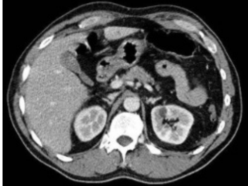
Fig 2 Abdominal Computed Tomography scan (ACT) demonstrating an image taken as the level of the kidneys and liver (Gans, Stoker & Boermeester, 2012).

(Gans, Stoker & Boermeester 2012). An ACT includes a low-dose x-ray called a topogram to plan the scan and includes anatomy from the patient's diaphragm to the symphysis pubis of the pelvis (see Fig 2) (Nguyen et al. 2011). The scan combines multiple x-rays from different angles around the patient and uses computer processing to create cross-sectional images. This creates a three-dimensional image of the patient's abdomen (Nguyen et al. 2011). It can be difficult for the emergency room physician to determine the most appropriate abdominal imaging exam for a patient, due to a lack of knowledge that exists among physicians and health care professionals regarding which tests provide the best diagnostic performance (Bertin et al. 2019). This results in emergency physicians and other healthcare professionals, such as nurse practitioners, ordering both the AXR and the ACT to ensure that a definitive diagnosis can occur. Performing both exams results in an increase of radiation dose to the patient, so it is important to compare the diagnostic sensitivity of both imaging modalities to comprehend which is the most appropriate abdominal imaging examination. Increasing awareness and education regarding imaging appropriateness for the abdomen can help hospitals create imaging protocols that will minimize additional imaging exams for those emergency department patients who require abdominal exams.