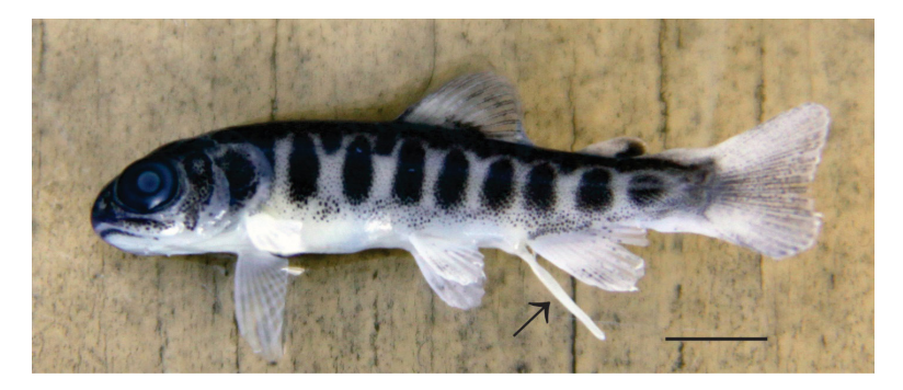
Fig 3 Brook trout ( Salvelinus fontinalis ) fry collected from Belliveau Brook on June 8, 2011 with an adult Echinorhynchus lateralis attached to the hind gut and protruding from the anus (arrow). Note that the lower lobe of the caudal fin appears shortened, possible because of abrasion on the substrate. Scale bar 4 mm.

The redd, while allowing protective development and growth, serves to delay initial parasitism within the stream. Similarly, open water dispersal of larvae of reef fishes is believed to reduce exposure of young hosts to parasites cycling on reefs (Cribb et al. 2000, Grutter et al. 2010, Peyruse et al. 2012), while larval migration of certain galaxiid salmonids, observed in coastal New Zealand, postpones early parasitism (Poulin et al. 2012). In contrast, hatchlings of the threespine stickleback ( Gasterosteus aculeatus ) pick up directly transmitted parasites, likely because they are associated with the male parents that guard the nest (Rybkina et al. 2016). King and Cone (2008) suspected newborn fry of brook stickleback ( Culaea inconstans ) acquired infections of the directly transmitted monogenean Dactylogyrus eucalius in the protective nest which males guard.