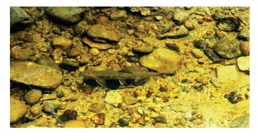
Fig 2 Bangor Creek in the fall of 2020 showing a young adult brook trout ( Salvelinus fontinalis ) on a spawning bed. The gravel redd is in the upper right corner. The trout was approximately 10 cm long.

The regional parasite species pool was determined from necropsy of an additional 537 brook trout of all ages (0+ and >1+) sampled