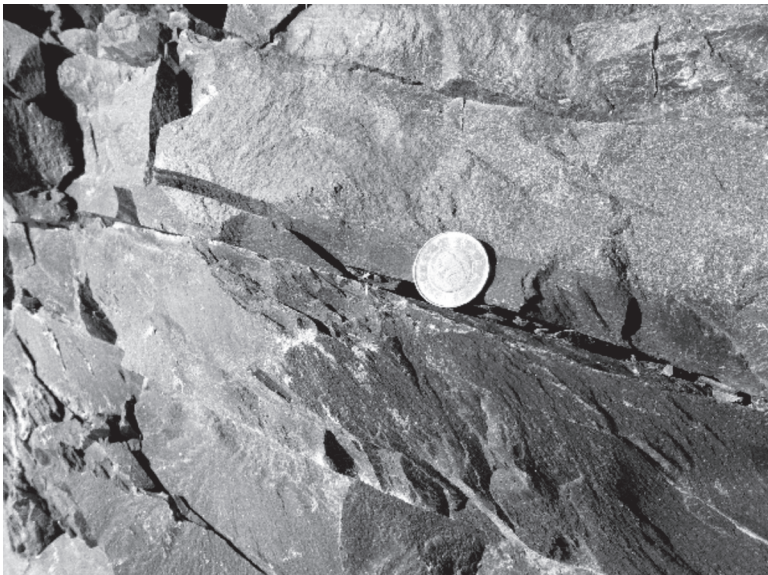
Fig 2 Exposed Meguma Group turbidite along Larry Uteck Drive. The transition from the top of one layer of turbidite to the bottom of the next is indicated by the horizontal line near the top of the toonie (2$ coin). Darker material below is the muddy top layer. Light material above is the sandy bottom layer of the next turbidity current deposit.

The next stop was Larry Uteck Drive, off the Bedford Highway. Blasting of the rock to put in the road left a vertical section of open rock face about 3m high where the layers of Meguma can be seen. The coarse and heavy sands were deposited first and then the lighter muds. The sequence repeated over and over as the turbidites built up one on top of the next off the Saharan Shield (See Fig 2). Deposits from three or four consecutive turbidity currents were visible in the rock wall.